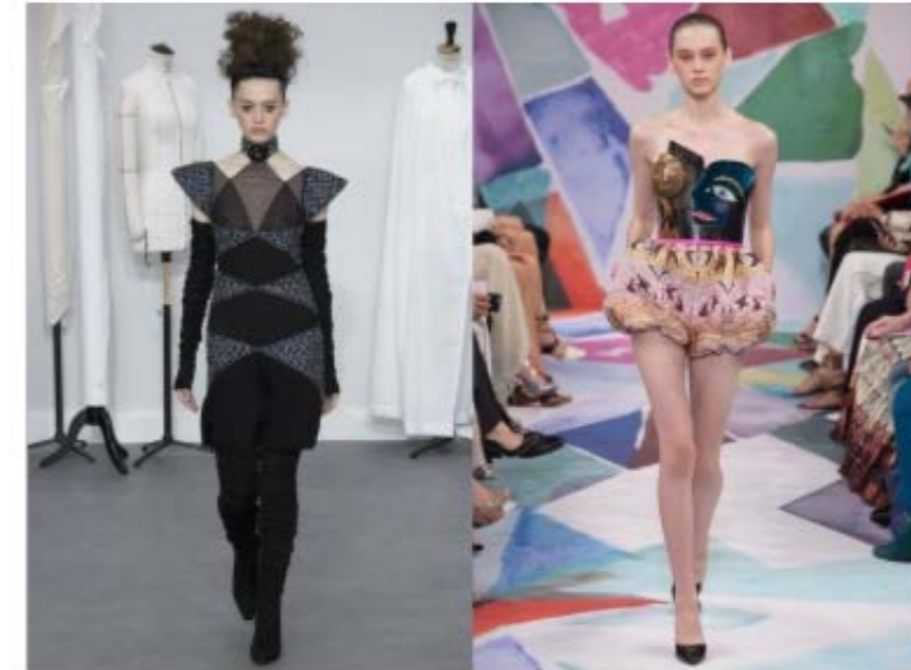
Chanel Couture Fall 2016

bigger and diverse than it seemed a couple of years ago when I was not modeling."